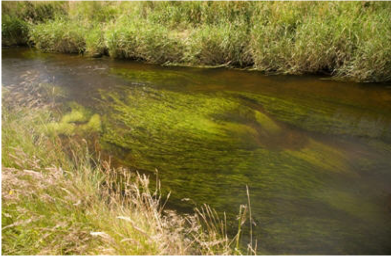
Afon Teifi - Submerged vegetation providing suitable S. morsitans habitat.