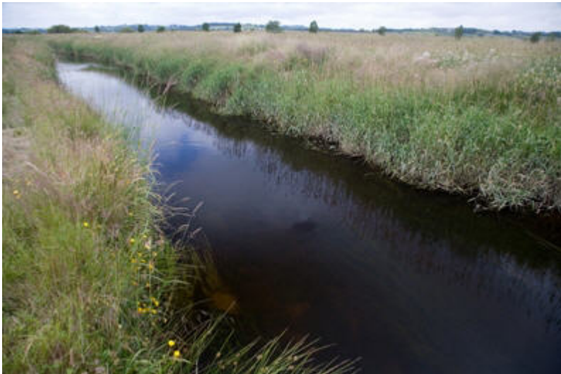
Afon Teifi – Slow and deep channel unsuitable for S. morsitans .

To an extent the creation of natural bank and riverbed features can be designed