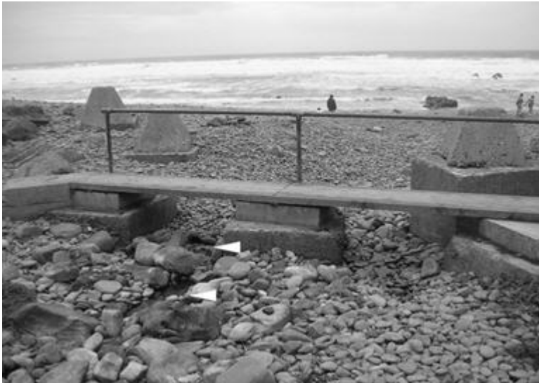
Fig 1. Collection site of S. angustipes at Bude, Cornwall (SS 202085).